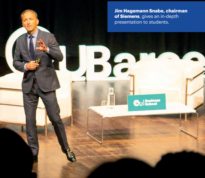
Jim Hagemann Snabe, chairman of Siemens , gives an in-depth presentation to students.